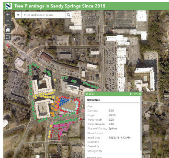
Citywide GIS map shows new trees planted by type, size, and other characteristics

Notable elements of the Tree Conservation Ordinance include a residential lot minimum requirement of canopy coverage, tree removal and replacement guidelines, Landmark Tree regulations, and canopy preservation requirements. For example, if any healthy tree (including Landmark Trees) is removed and causes the tree canopy to fall below the residential lot minimum requirement of 35 percent, either new trees must be planted or a payment must be made to the City’s Tree Bank for a new tree. Landmark Trees must be replaced at 150 percent of the lost canopy.